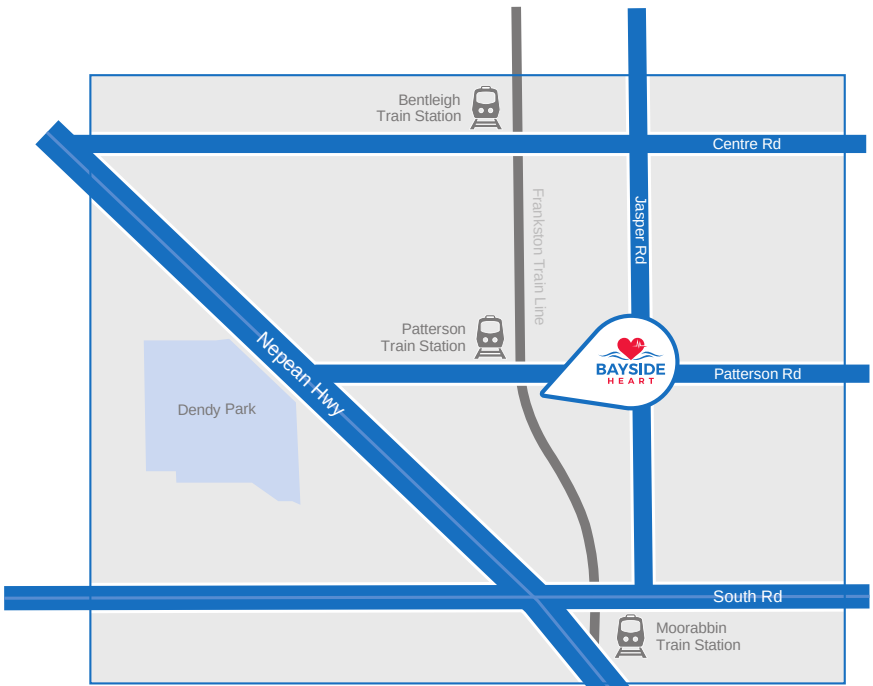
116 Patterson Rd, Bentleigh VIC 3204

Main rooms and all correspondence: 116 Patterson Road, Bentleigh 3204 Phone: (03) 9133 9000 Fax: (03) 9133 9009 Web: www.baysideheart.com.au Email: info@baysideheart.com.au